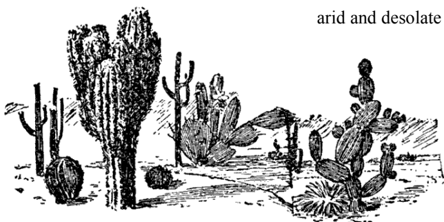
arid and desolate

(adj) extremely dry, especially from lack of rainfall.